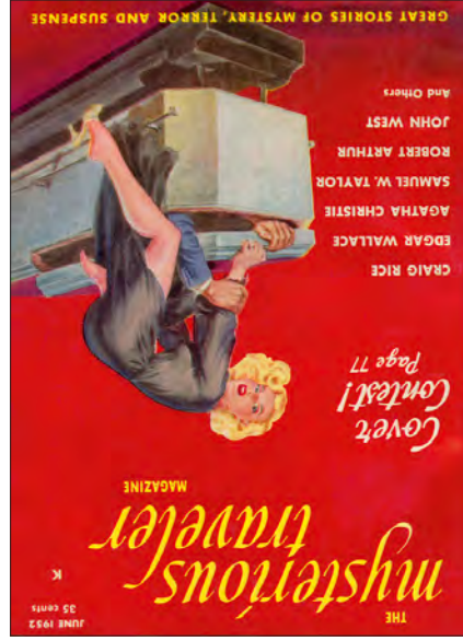
The Mysterious Traveler Magazine #4 June 1952