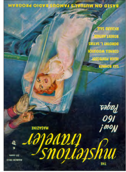
The Mysterious Traveler Magazine #3 March 1952