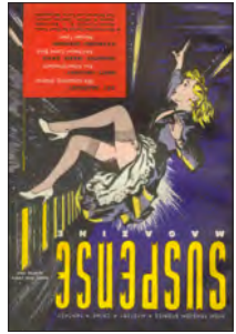
Suspense #4 Winter 1952