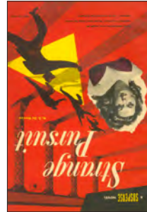
Suspense Novel #1 1951