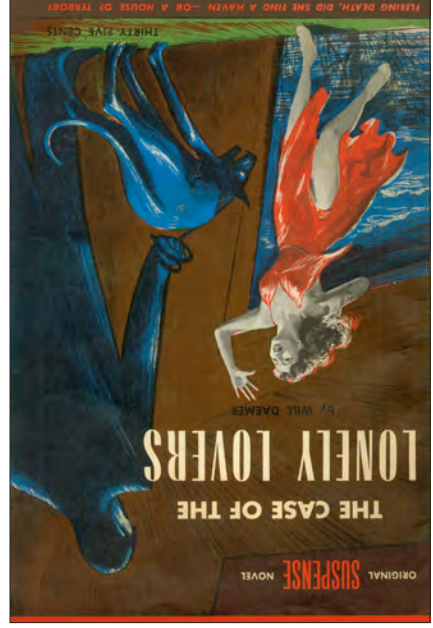
Suspense Novel #2 1951