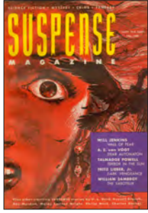
Suspense #3 Fall 1951