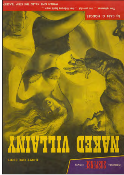
Suspense Novel #3 1951