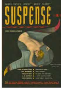
Suspense #1 Spring 1951